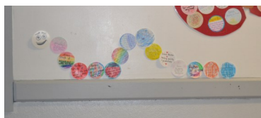
December's virtues caterpillar

His desire to increase devotion to St. Joseph inspired him to found a shrine to his favorite saint across the street from Notre Dame College. He saved the money he earned from giving haircuts at five cents apiece, eventually earning $200 to construct a simple structure. Brother André was released from his duties as doorkeeper and assigned full-time as the caretaker of the Oratory of St. Joseph. Many people experienced physical healings after praying with Brother André, and he is credited with thousands of healings associated with his pious devotion to St. Joseph.