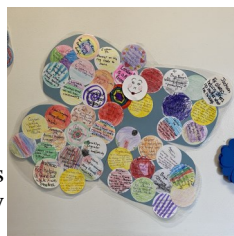
November's virtues butterfly